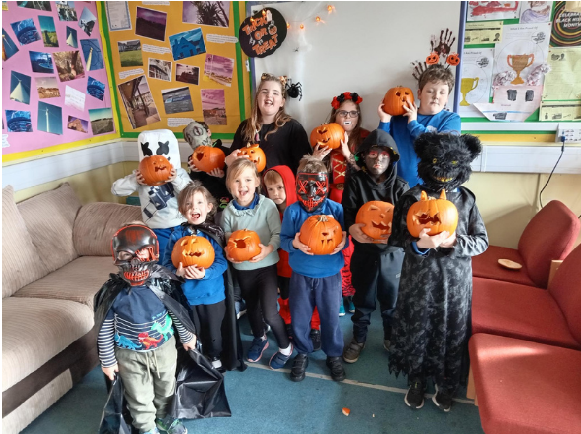
Gigha Primary School children on Halloween